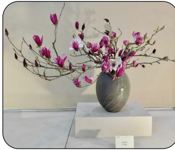
Leona Fung 花扇